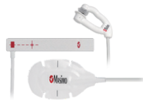
Masimo Veterinary SpO 2 Sensor