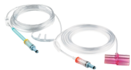
Veterinary EtCO 2 Sampling Lines