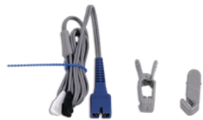
Nellcor Veterinary SpO 2 Sensor