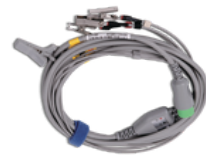
Veterinary 3-lead ECG Cable (Monitor)