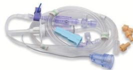
Veterinary IBP Connector