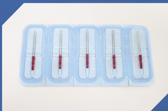
5mm Blades (5 pack)