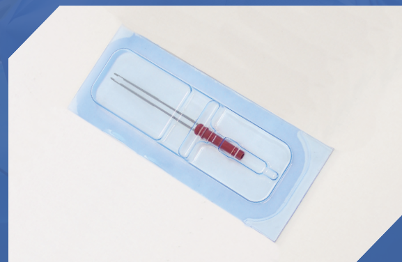
5mm Blade Single